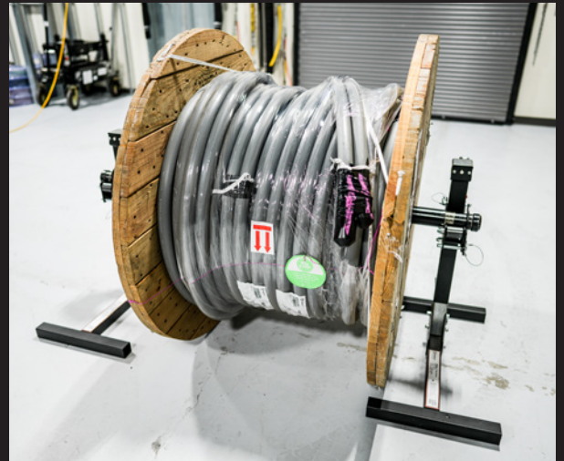
TWO CONDUITS ON A SINGLE REEL