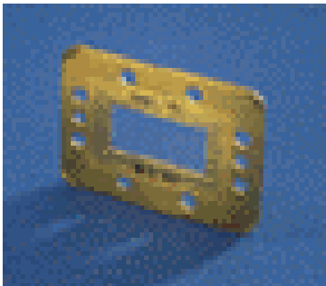
223306-100 Pressure Window for WR90, 8.2–12.4 GHz, mates to PDR100