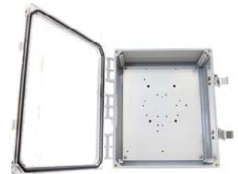
12x10x4 Polycarbonate Enclosure with Clear Door and Locking Latch-