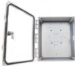
12x10x4 Polycarbonate Enclosure with Clear Door and Key Lock