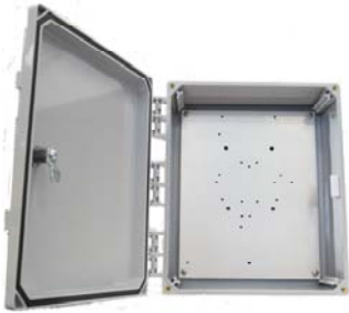
12x10x4 Polycarbonate Enclosure with Solid Door and Key Lock

The polycarbonate enclosures are intended for indoor and outdoor use to protect wireless equipment from the elements and theft. These rugged enclosures are extremely affordable and are the lightest weight enclosure solution TerraWave offers. Every TerraWave enclosure is covered by the company's two-year TerraNet warranty program. For questions and to purchase product, contact a Regional Sales Executive at 210-375-8482, 800-851-4965 or sales@terrawave.com.