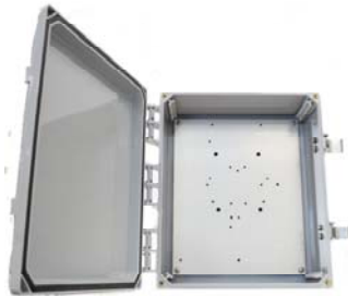
12x10x4 Polycarbonate Enclosure with Solid Door and Locking