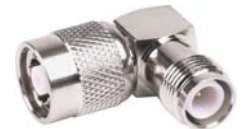
RA RPTNC Jack (F) to RPTNC Plug (M)