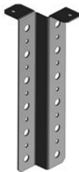
ZB-V12 Vertical Z-bracket, 4.3 in, for 12 coaxial cable runs