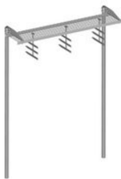
WB-K210-B Safety Grated Waveguide Bridge Kit, 24 in x 10 ft, with two 13 ft 4 in direct burial posts