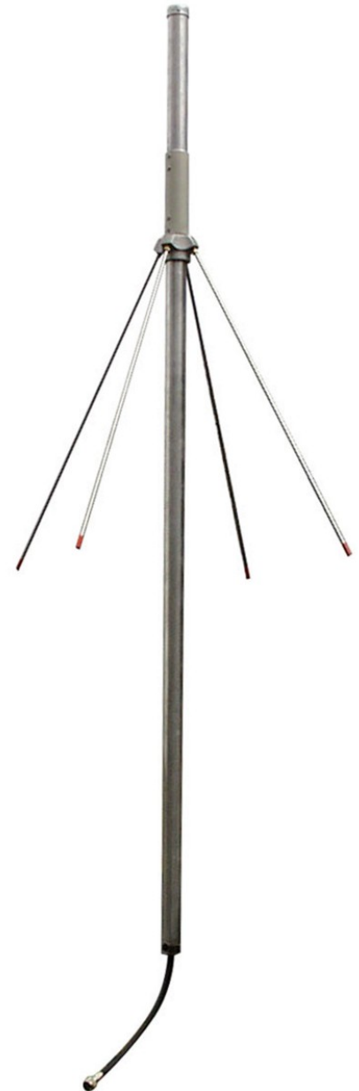
Antenna may not appear exactly as picture.

The SG238 is a broadband omni-directional antenna offering a low VSWR over the operating frequency range. Constructed of selected aluminum alloy and stainless steel, the SG238 is designed to withstand winds of 155 mph while supporting 0.5 inches of radial ice. The antenna is at DC ground potential for lightning protection.