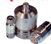
RAPID FIT™ Connectors