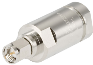
SMA Male Positive Lock for 1/4 in LDF1-50 cable