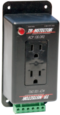
ACP 100 DR2 1101-608

15 A and 20 A DIN rail panel mount surge protection convenience outlet with visual and remote status monitoring