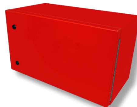
BBC-003 Battery Back-up Enclosure shown