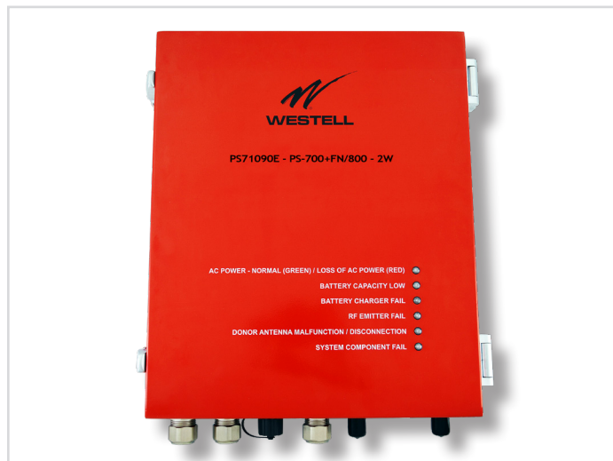
PS71090E Public Safety Signal Booster shown