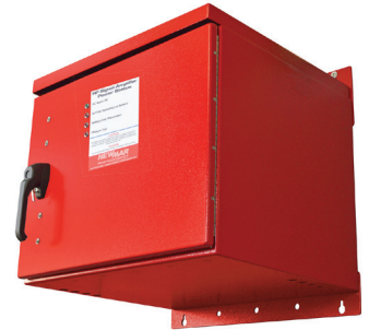
Enclosure B 48V, 100AH