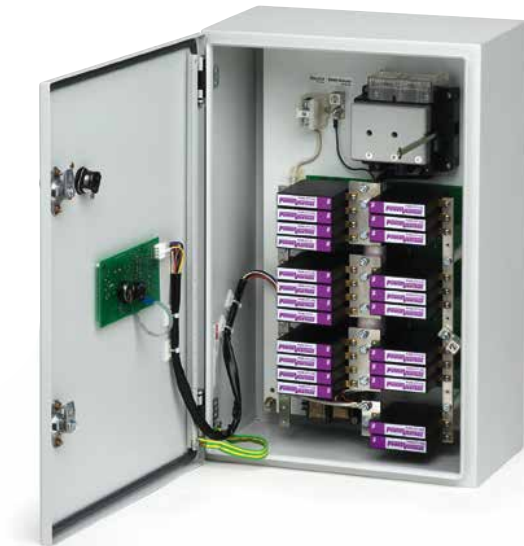
PV Plus Series

PowerVantage (PV Plus) is a per mode modular surge suppression unit with all modes of protection listed to UL 1449 4th Edition and designed with robust surge capacity for long life. PV Plus is engineered for easy installation and serviceability to eliminate downtime and protect your critical equipment.