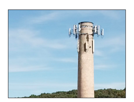
Ruggedized Construction Designed with UV and environmental rated materials to meet 746C (f1) standards.