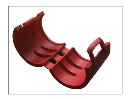
Single Piece Design The injection-molded, single piece design makes it easy to install cuffs onto cables, even while wearing work gloves.