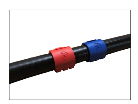
360° Visibility Full 360° coverage in easy to identify industry standard colors.