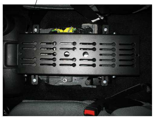
FIG 7 - Top Plate Installed