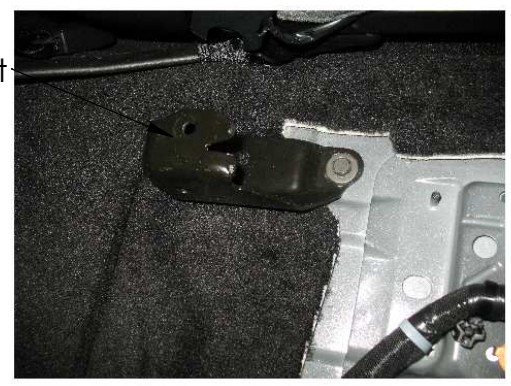
FIG 4 - Rear Driver Bracket

4. Install the leg kit brackets across the reinstalled center seat brackets and the brackets attached to the passenger seat. Install the 1/4" spacers from the hardware bag between the leg kit and OEM brackets on the passenger side for leveling purposes. Bolt them in place using the 5/16-18 bolts, 5/16 washers and 5/16 nylock nuts included in the hardware bag. See FIG 5 and FIG 6.