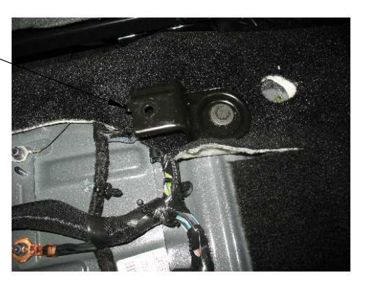
FIG 3 - Front Driver Bracket