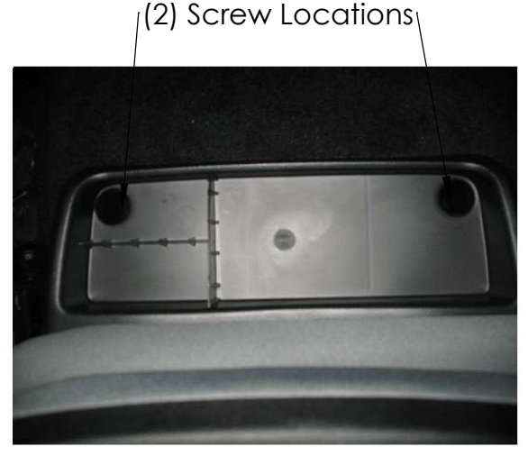
FIG 1 - Front Tray Removal