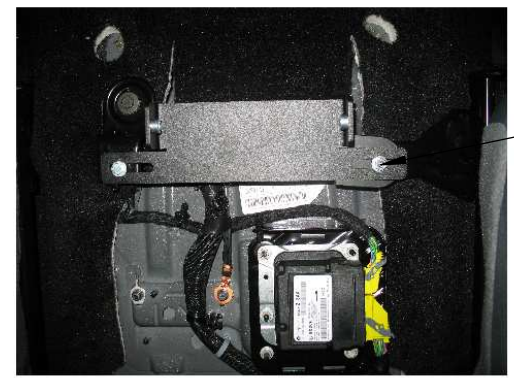
-1/4" Spacer, Passenger Side

5. Install the top plate onto the leg kit using the 3/8-16 bolts and 3/8 washers included in the hardware bag. See FIG 7.