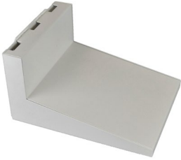
Right Angle Wall Bracket w Lid Tessco No. 521473