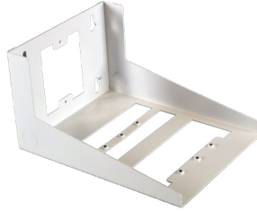
Right Angle Wall Bracket Tessco No. 538527