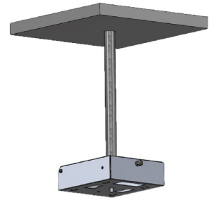
Hanging Conduit Mount Tessco No. 211234