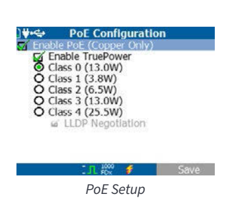
TruePower™ PoE Testing - Power Over Ethernet Testing

LinkRunner AT features the ability to validate TruePower delivery before installing cameras, APs, and phones to ensure a smooth deployment. Quickly validate PoE performance by drawing actual power up to the 802.3at standard 25.5W. Load the circuit to stress switches, cabling and patch panels, all while measuring the voltage and pairs being used.