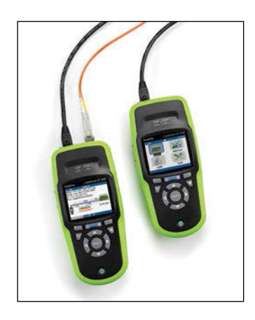
Left: LRAT2000/ Right: LRAT 1000