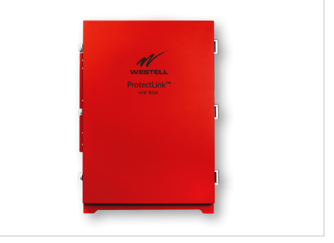
VHF Bi-Directional Amplifiers (BDAs) Westell<sup>®</sup> ProtectLink<sup>™</sup> Public Safety Series