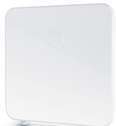
Bridge-in-a-Box UHD PRO