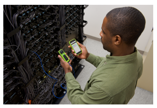
LinkSprinter and Mobile Device Application Shot

LinkSprinter can be paired with a mobile device to reveal more information about the network test! First, connect to the LinkSprinter as a short-range Wi-Fi access point. Then, open your browser on your mobile device and type in the address 172.16.9.9. The webpage will allow you to view more detailed information, such as port name, model, server address, and more. When connected with Link-Live, you can also add comments to your testing results for further documentation.