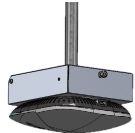
Shown with an Aruba AP