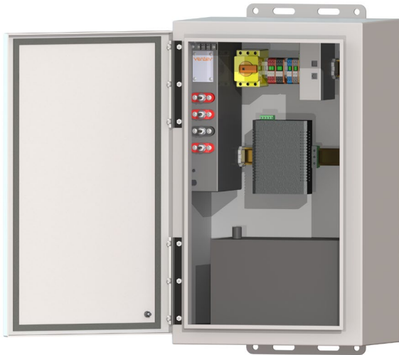
Multi-Port Power Extender for Light Poles TESSCO No. 200667